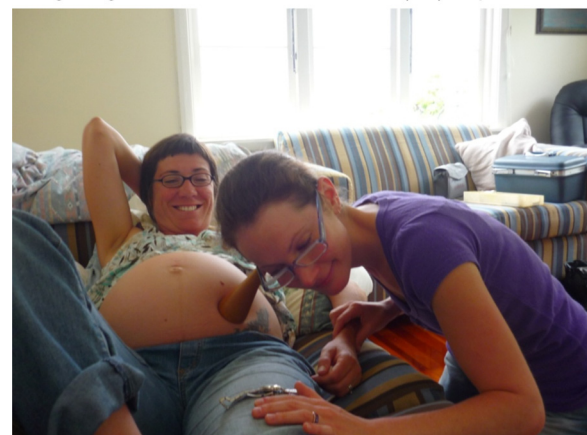
Fig. 2. Auscultation of the fetal heart sounds with a Pinard stethoscope.